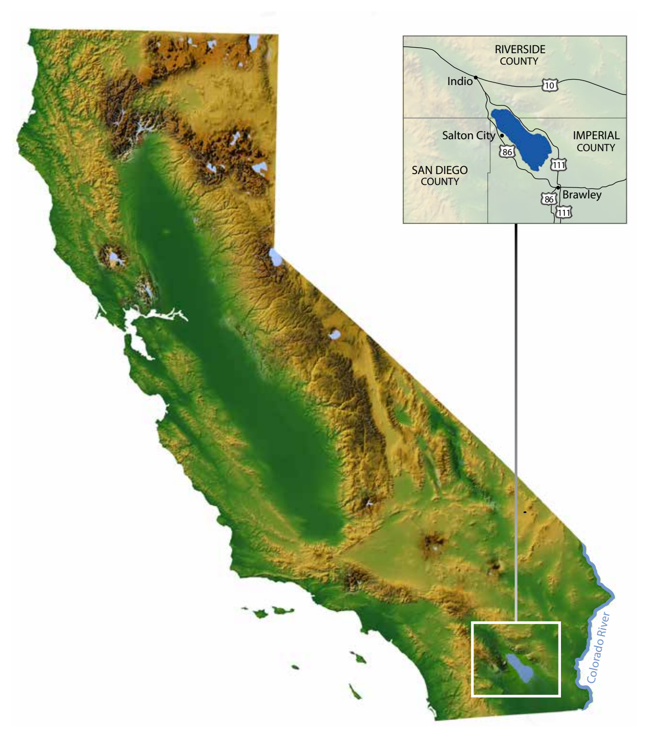
Figure 1 Location of the Salton Sea