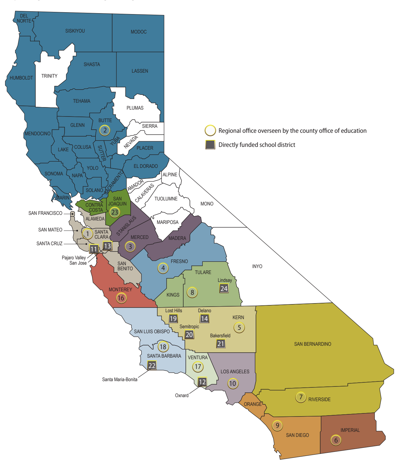
Figure A Map of Migrant Education Program Regions