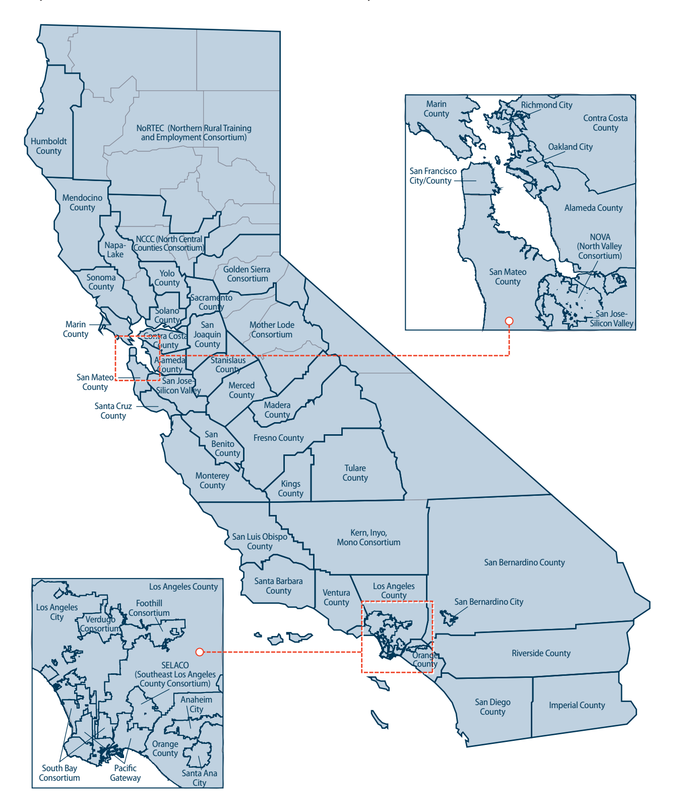
Figure 2 Map of California's 49 Local Workforce Investment Areas as of July 1, 2011