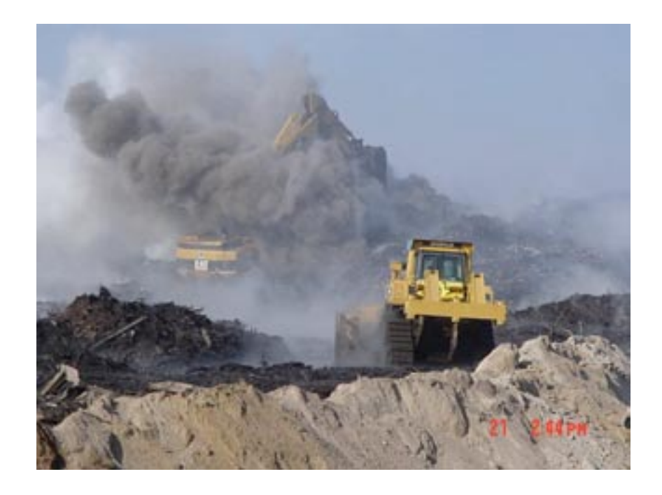
This photo illustrates the amount of smoke that was generated from the Crippen Site fire.