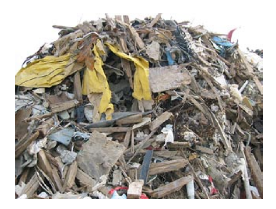
This photo illustrates the types of material brought to the Crippen Site.

About five months before the fire, however, the Fresno LEA had raised concerns to board staff about inappropriate types of materials brought to the Crippen Site and asked what it could do about this situation. The Fresno LEA and the board differ about the guidance the board provided at this time. According to the Fresno LEA, board staff advised them to wait for regulations on construction and demolition activities before requiring the Crippen Site to get a solid waste facility permit, which would give the Fresno LEA more direct authority over the site.