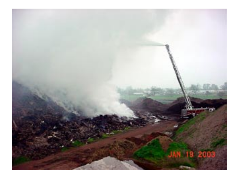
This photo illustrates the size of the debris pile at the Crippen Site that the city of Fresno Fire Department had to contain.

Depositing soot on vehicles and homes within a mile of the site, smoke from the fire contributed to significant air pollution, which required local health officials to post air quality advisories to local residents. The San Joaquin Valley Air Pollution Control District indicated that inhaling particulate matter, such as soot and ash, could aggravate health conditions such as bronchitis and asthma, increasing the risk of heart attack for people with heart disease. A public health group presented an additional health advisory at a town hall meeting on January 23 and at the Fresno Unified School District the next day. In response to public health concerns and reports of symptoms from residents living near the fire, local legislators convened a health-screening service at which local volunteer medical experts conducted interviews and medical evaluations that revealed many residents were experiencing irritation and inflammation of the respiratory tract. Also, medical experts advised residents with preexisting chronic respiratory or cardiovascular illnesses to seek further medical care for their conditions.